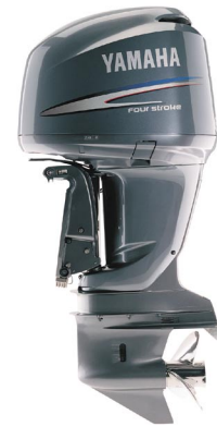
F200TXR / LF200TXR